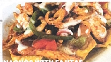
NACHOS WITH FAJITAS

Chicken, steak or mixed grilled with onions and bacon. Topped with cheese sauce and cheese.