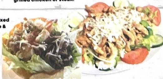
TOP GRILLED SALAD

Lettuce, green peppers, cucumbers, onions, cheese, tomato, grilled chicken or steak.