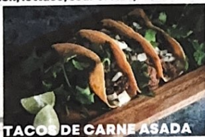
TACOS DE CARNE ASADA

Four soft double corn tortillas tacos filled with your choice of meats (below), onions, redishes, limon & cilantro.