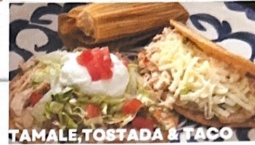
TAMALES, TOSTADA & TACO

TACO, ENCHILADA, TAMALES, TOSTADA, CHEESE QUESADILLA, BURRITO ADD ON TOP: Guacamole-$1.59, Sour Cream-.75, Pico de Gallo-.75, Cheese Sauce-$1.59, Shredded Cheese-.99