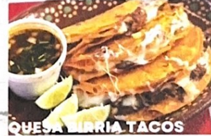
QUESA BIRRIA TACOS