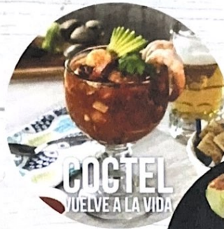
COCTEL VUELVE A LA VIDA

Raw oyster cocktail, tomatoes, pepper, onions served with your choice of crackers or tostadas.