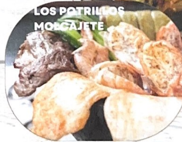
LOS POTRILLOS MOLCAJETE