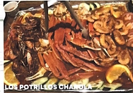
LOS POTRILLOS CHAROLA

Large tray mixed with crab legs, shrimp, head on shrimp cooked in homemade spicy sauce.